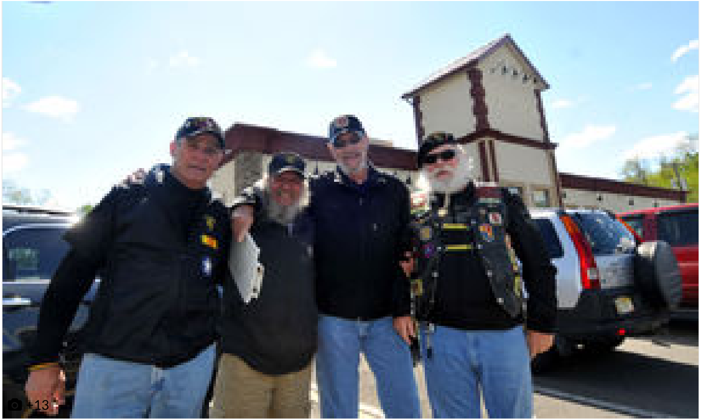
Burlington County veterans find solace at PTSD support group