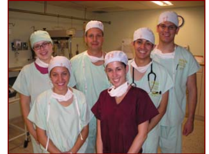
On Ob/Gyn floor of Medellín's General Hospital

During the first 4 weeks, our schedule would include classes (Infectious diseases, Ob/Gyn, Emergencies & Disasters) in the morning followed by a hospital rotation (Pediatrics, Family Health, Ob/Gyn, Internal Medicine) in the afternoon, and for the first 2 weeks, we also had medical Spanish classes in the evening. At times, I felt overwhelmingly busy, but always in the company of interesting people and places.