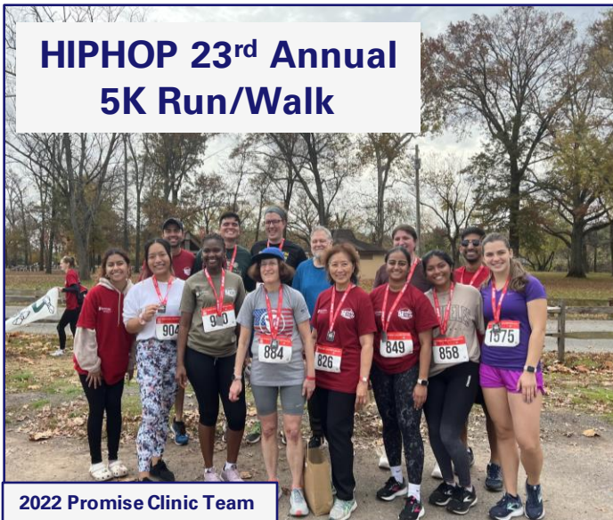
2022 Promise Clinic Team

The annual HIPHOP 5K Run/Walk raises funds for HIPHOP community health initiatives, including Promise Clinic. Thank you to all participants and donors!