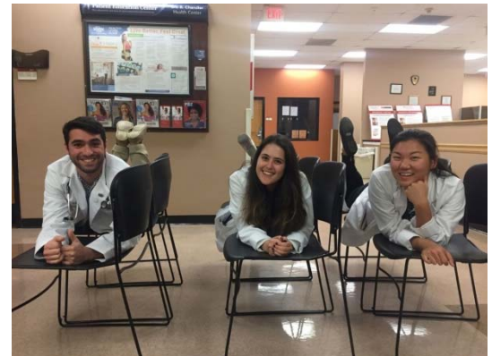
Student doctors in the patient waiting area before clinic hours.