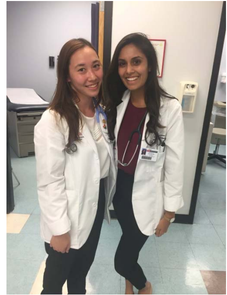
Two student doctors waiting to see their patient!