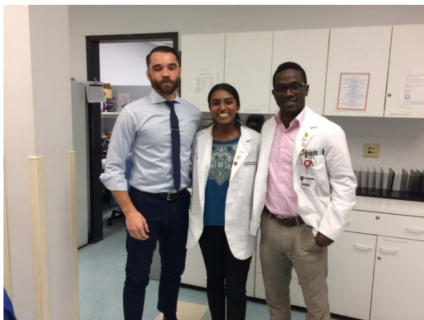
A student doctor care team on a Thursday night at Promise Clinic.

171 Student-Doctors, 64 Steering Committee Members, 13 Physician Preceptors, 2 PharmD Students, 1 Unified Mission