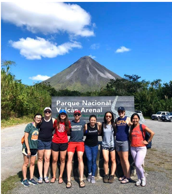
2020 IHCAI Institute multi-program student group weekend trip.