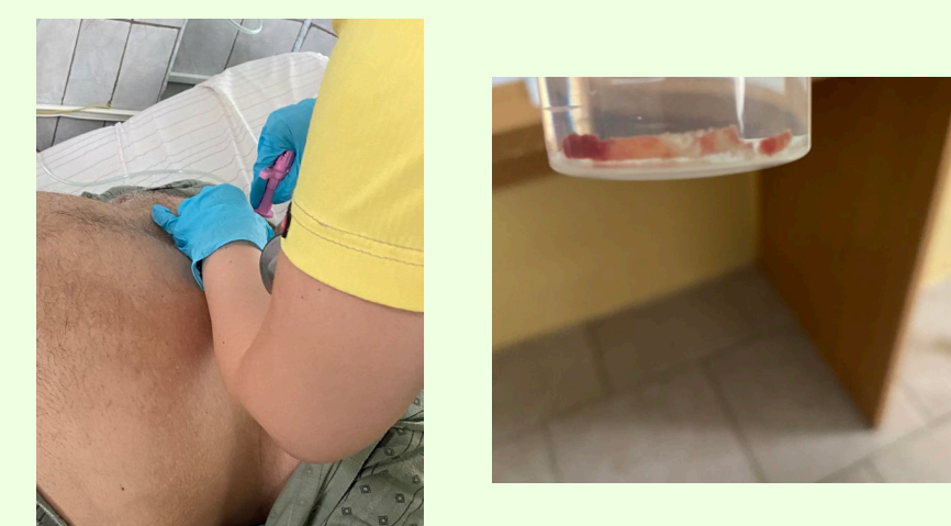
Bone marrow aspiration