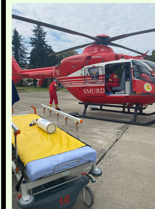
SMURD- air ambulance