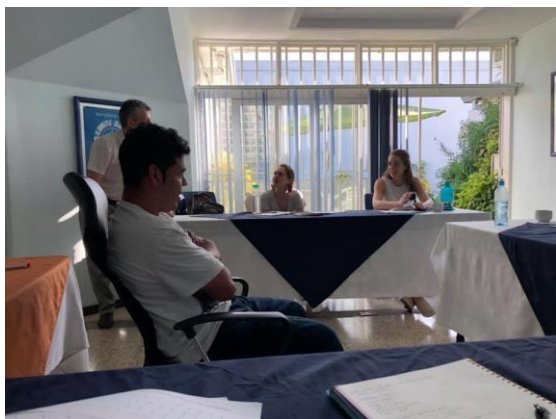
Simulated patient and sports activity in P010A – 2020

Document template last change: February 2023