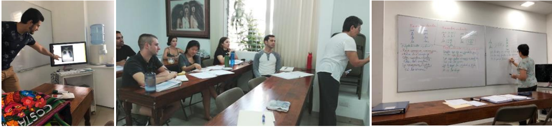
IHCAI Institute Clinical Scenarios and Grammar Instructors with 2019 students.