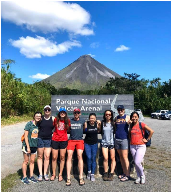
2020 IHCAI Institute multi-program student group weekend trip.