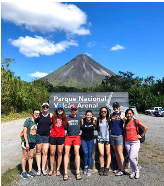
2020 IHCAI Institute multi-program student group weekend trip.