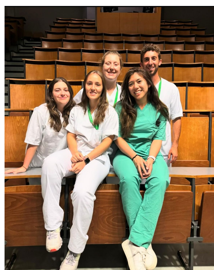
Waiting for afternoon lecture to begin!