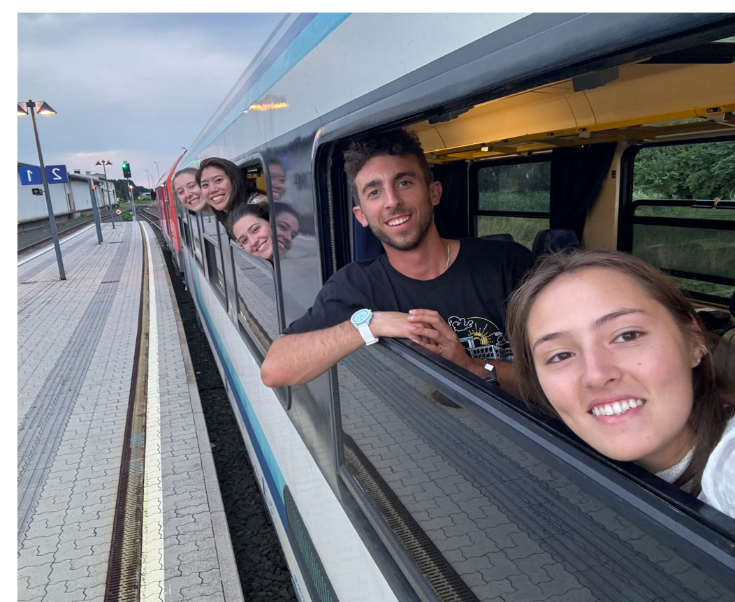
Train back to Graz!