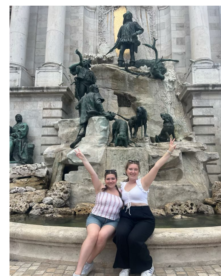
Matthias Fountain – a stop on the Buda Castle walking tour.