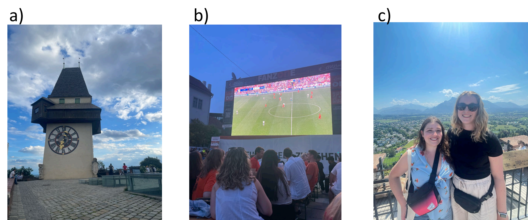
a) Schlossberg, b) Euros cup watch party, c) View from Salzburg fortress