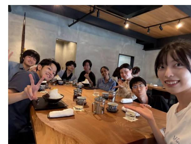
5th Year Kobe Medical Students