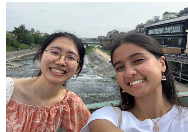
Azumi and me