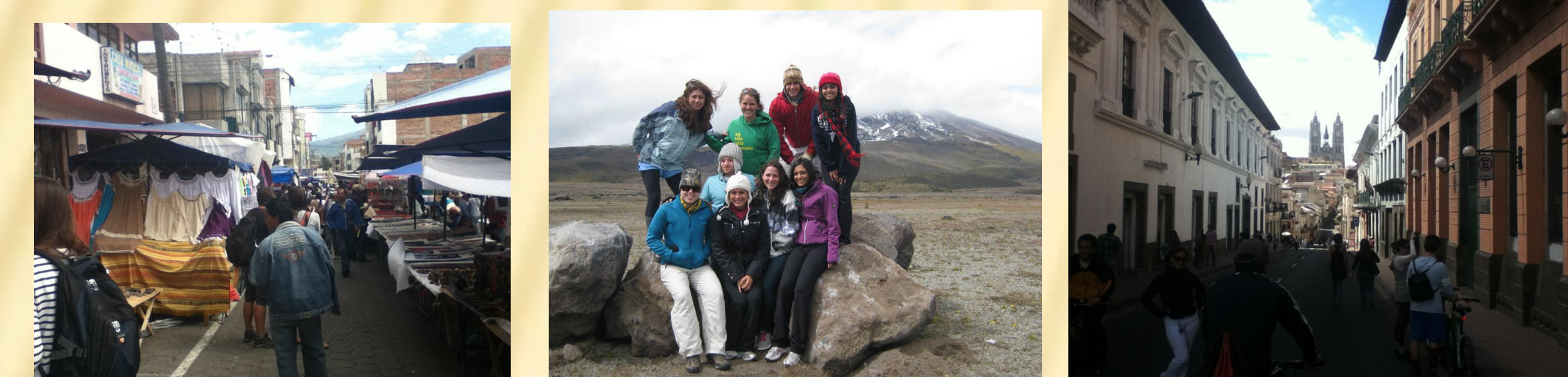
Pictures from left to top right: Market outside Quito, foot of Cotopaxi, La Basílica, Cotopaxi, La Iglesia de la Compañía de Jesús